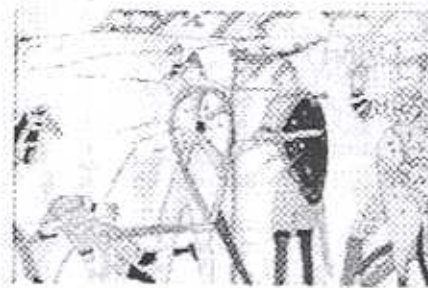
Harold's end in the Bayeux Tapestry

In 944 after the death of Kniaz (King) Ihor, his wife Kniahynia (Queen) Olha as Regent for her young child, Sviatoslav, went into battle with the Derevjany who had murdered her husband. She started a war by attacking their cities. Kniahynia Olha rode at the head of her army surrounding the city of Iskorostyn where Ihor was killed. Throughout the whole summer the Derevjany defended the city and Olha was unable to capture it. Frustrated, she cleverly demanded a tribute of three pigeons and three sparrows from each "dvir" or household.